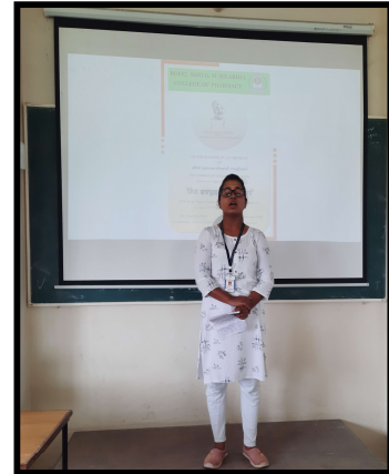
Students singing songs and reciting poem of Shri Zaverchan Meghani