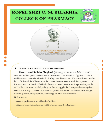
Brochure of “The Songs of Meghani